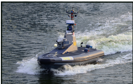
[ USV ]