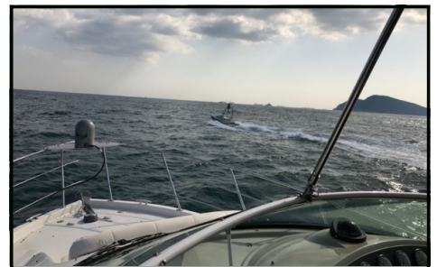
[ Vessel ]