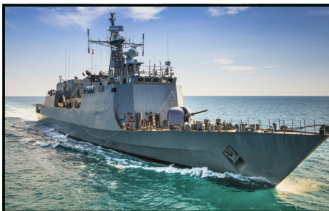
[ Navy ]