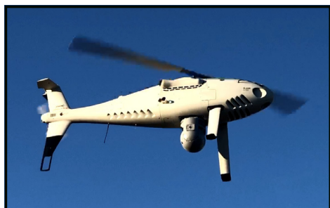
[ UAV ]