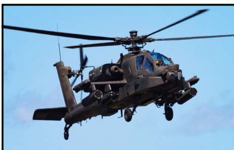
[ Airborn ]