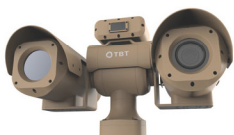
Cooled Multi Sensor