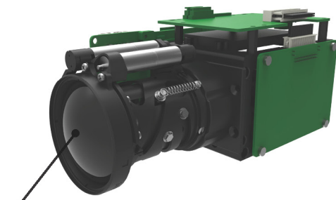
[ Compact Cooled Thermal Imaging Camera Module F/5.5 ]