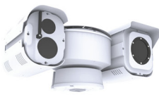
Cooled Compact PTZ