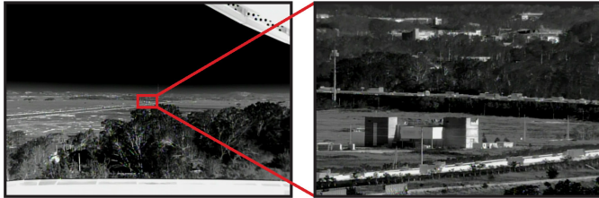
7km Zoom (300mm F4.0 Lens, Invers OFF)

TCM-640/TCC-640 provided with various continuous optical zoom(TCM-640 : 300mm, 420mm, 600mm, 690mm, 900mm / TCC-640 : 275mm, 700mm, 850mm) for all the EO system requirements.